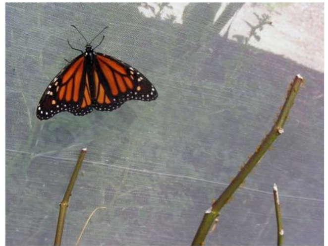
Adult Monarch butterfly with denuded tropical milkweed stalks in the foreground.

Thank you to the Events Committee for planning such a wonderful family outing.