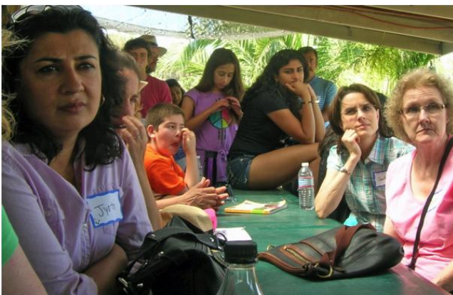
Listening the talk about butterfly habitat and development

The Butterfly Farm, located in Vista, offers educational opportunities for groups. With a $5 suggested donation per person, the event was reasonably priced for most families. The morning began with a talk by the owners of the farm about the development of butterflies, pitched at just the right level for the children present.