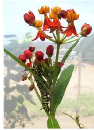
Monarch caterpillar noshes on tropical milkweed.

Lunch was taken at the shaded picnic tables, with delicious potluck food brought by participants.