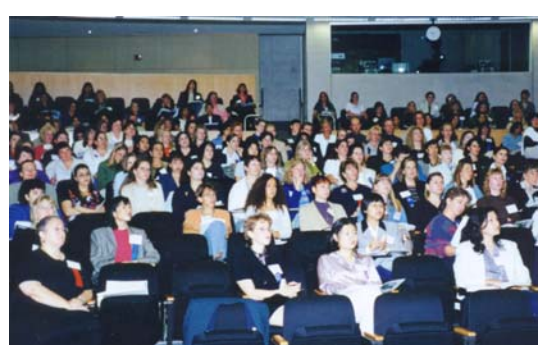
Women in Bioscience Conference photo by Emelyn Eldredge.