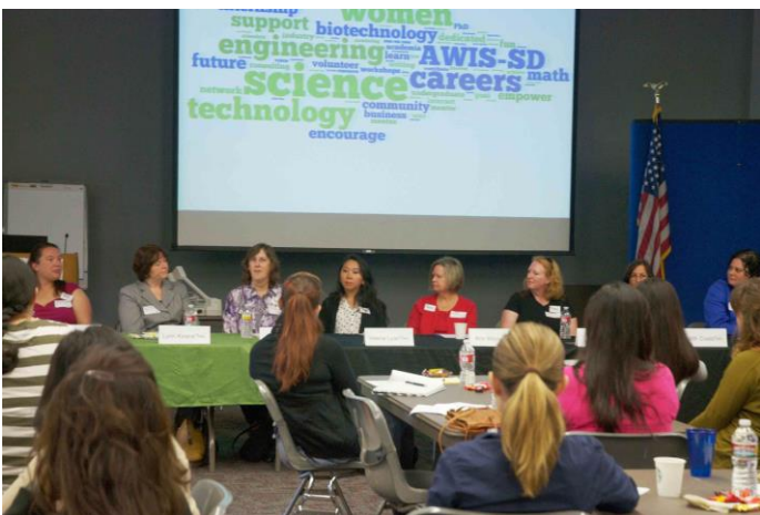
The panelists explained their career paths, their daily work,

This year, this inspiring event included 12 panelists and 26 attendees. Women from different fields of science and engineering were invited to share their experiences and answer questions for undergraduate women. The diverse panel included two engineers, a chemistry professor, a biomedical professor, a computational biologist, a computer science professor, a clinical lab scientist, a biotech director, a patent lawyer, a nursing scientist, and an interpretation specialist from the San Diego Zoo. The attending undergraduates comprised students from various colleges in San Diego, including California State University San Marcos, University of California San Diego, San Diego State University (SDSU), Palomar College, San Diego Mesa College and City College. We also had two high school students attend the event!