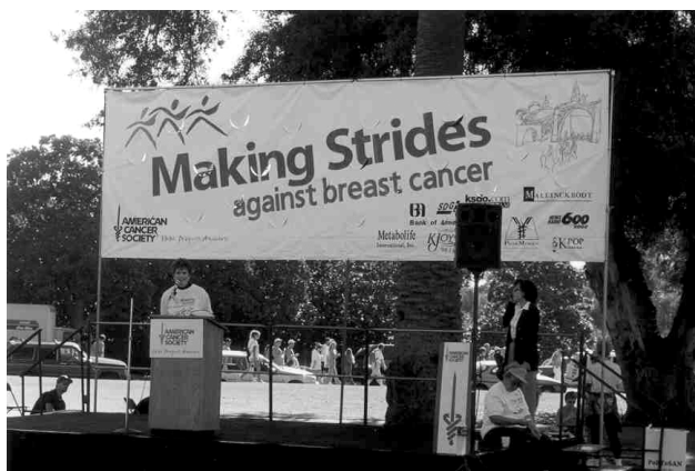
AWIS members participated in the American Cancer Society's Making Strides Against Breast Cancer walk.