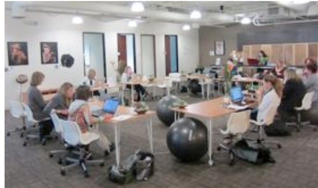
Photo of Hera Hub workspace

working space for female entrepreneurs in San Diego. This as-needed, flexible work and meeting space provides a productive work environment for women. Hera Hub members have access to professional office space to meet with clients and are able to connect and collaborate with like-minded businesswomen, giving them the support they need to thrive. It is the perfect place for collaboration, community, credibility, and visibility" (from the Hera Hub website http://herahub.com/ ).