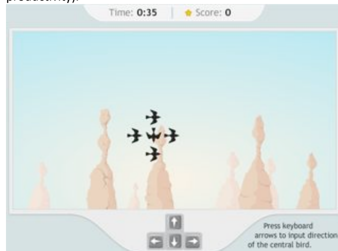
Screenshot of "Lost in Migration"

Lumosity's 40 games are quick, simple, and – most importantly – fun. Each game is designed to improve one brain area – attention, flexibility, memory, problem solving, or speed. There's "Speed Match," where cards with symbols are shown on the screen and the user must state if the symbol on the card matches the symbol on the previous card. This simple game helps boost reaction time and is intended to speed up cognitive processing. Another game is "Raindrops," where raindrops with basic arithmetic problems fall down the screen. "Raindrops" helps improve the user's ability to perform mental calculations and is supposed to increase their aptitude with numbers. In addition, there's my personal favorite, "Lost in Migration," in which a flock of five birds appears on the screen, and the user must quickly spot the direction of the center bird. This is aimed at helping to increase focus and concentration (and therefore productivity).